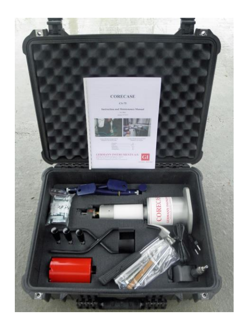
CORECASE CS-75: Coring device for producing the partial core.