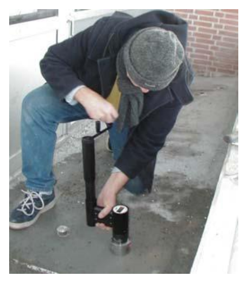
The bond of a repair on a balcony being evaluated with BOND-TEST