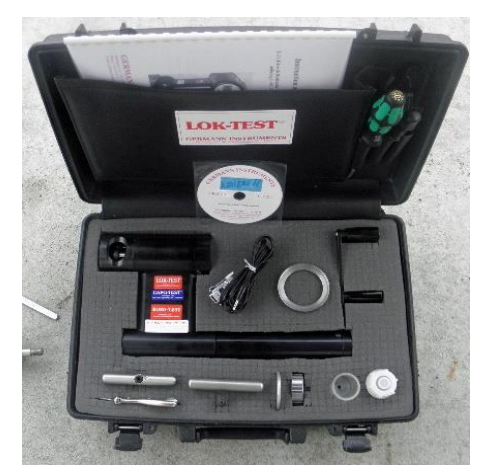
The pull machine can be used for pullout test (LOK and CAPO tests)