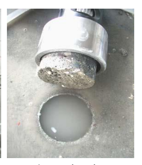
BOND-TEST being performed for quality control of the bond between a wear resistant overlay and a concrete slab; coring after bonding the 75- mm disc is shown (left), application of pull-off load (middle), and the bond failure, type (b), between the overlay and the substrate (right) at 1.8 MPa