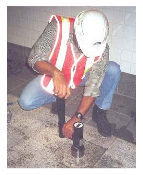
BOND-TEST being performed on granite tiles in a subway station